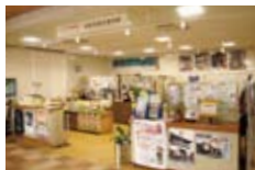
Takeo Onsen Station Tourist Information Center

Tel./Fax. 0954-23-1145 Hours: 9:00-17:00 Access: 13 min. walk from Takeo Onsen Sta. http://blog.goo.ne.jp/takeomachinaka/ takeomachinaka@yahoo.co.jp Closed: Wed.