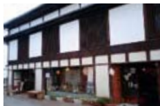
Tourist Information Center. Gabai